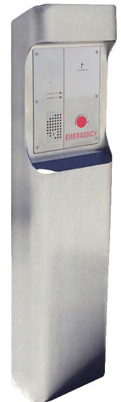
ETP-PM-SS shown with VOIP-500E