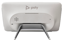
Poly TC10 White Touch Controller

The Poly TC10 touch control panel makes meetings more productive and allows users to easily schedule workspaces and conference rooms.