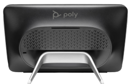
Poly TC10 Touch Controller Black

The Poly TC10 touch control panel makes meetings more productive and allows users to easily schedule workspaces and conference rooms.