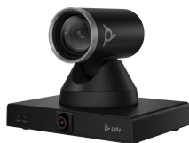
Poly Studio E60 Smart Camera 4K MPTZ with 12x Optical Zoom

Keep presentations engaging with the Poly Studio E60 smart MPTZ optical zoom camera. The main presenter is always in frame, and every person in the room is shown with exceptional accuracy, even at the far end. With every detail captured, presentations are easier to follow.