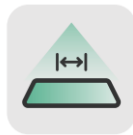
Customizable detection area

Covers larger areas, reducing the number of deployed sensors and lowering enterprise costs.