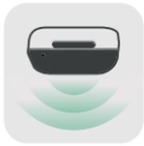
Wide detection range

Covers larger areas, reducing the number of deployed sensors and lowering enterprise costs.