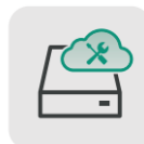
Cloud device management

Supports temperature, humidity, and illumination in meeting rooms, enabling data reporting and integration strategies.