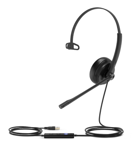
UH34/UH34 Lite Mono Teams UH34/UH34 Lite Mono UC

The hand-held controller with LED indicator provides easier access to key call control capabilities, including answer call, end call, reject call, and mute/unmute.