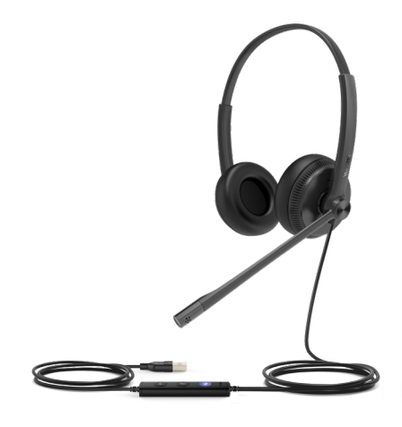
UH34/UH34 Lite Dual Teams UH34/UH34 Lite Dual UC